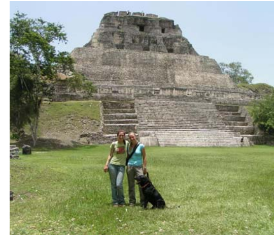
VT students studying in Belize

A study abroad course in Belize offered by the College of Natural Resources and College of Agriculture and Life Sciences