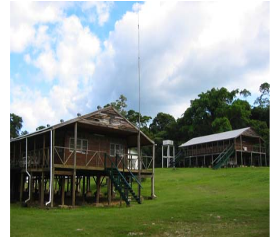
Photo shows Las Cuevas Research Station, located in Chiquibul Forest Reserve and National Park.

DAY 7 – San Ignacio area – Visit Central Farm, Ag Extension, local honey producer Africanize bees